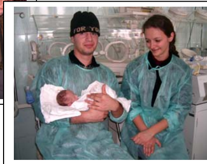
Neonatal Intensive Care Unit