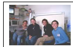
Master Occupational Therapy Students